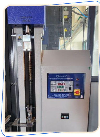
Load Cell Machine