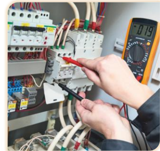
Electrical & Electronics